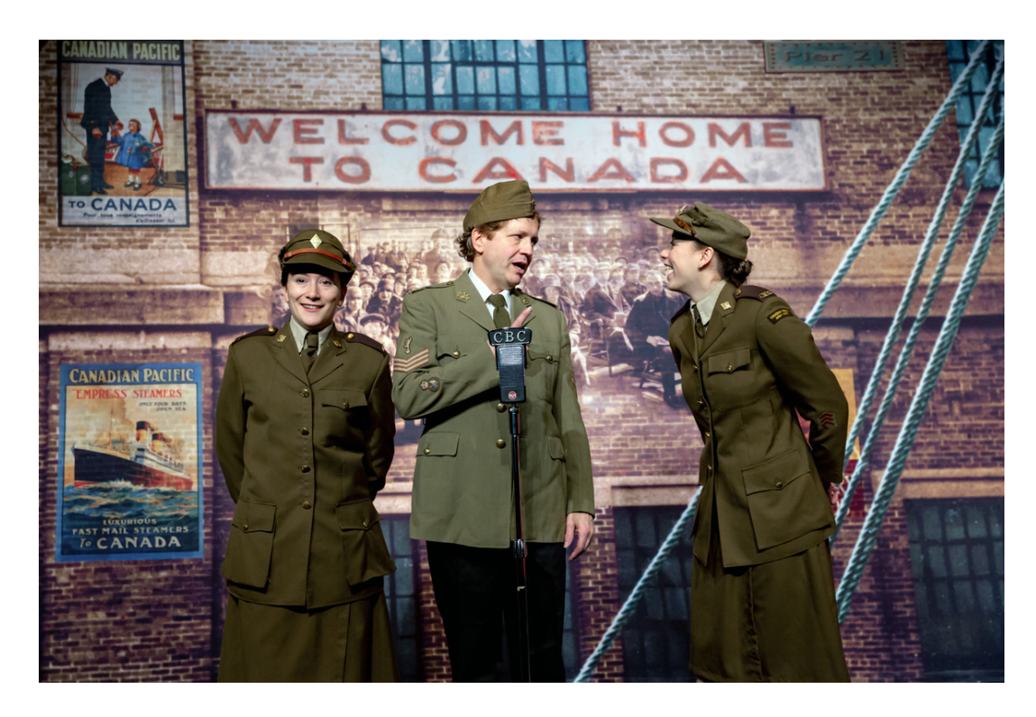
The Canadiana Musical Theatre Co.